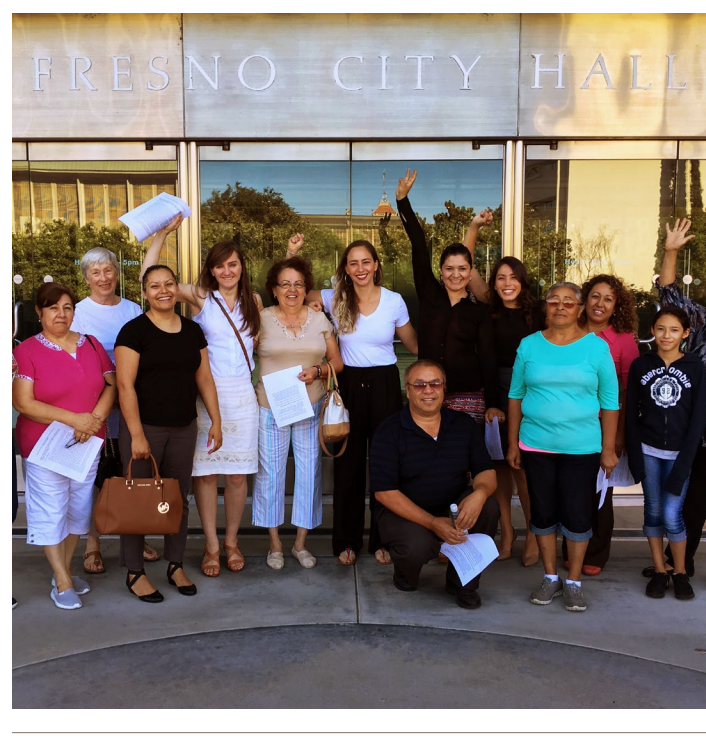
All-In Cities: Building an Equitable Cities Movement

Below: A young person at PUSH Buffalo's Grant Street Neighborhood Center, which provides a safe community space with resources and programs in response to expressed community needs of Buffalo's West Side.